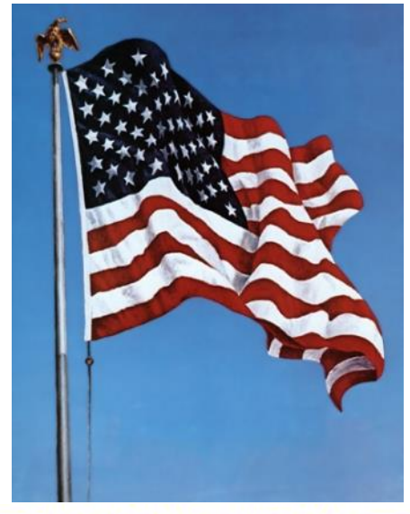
The Official Publication of the 4th Degree, Knights of Columbus, of North Carolina

Thanksgiving Day, (fourth Thursday in November) National Pearl Harbor Remembrance Day, December 7 (half-staff all day) Christmas Day, December 25