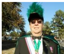
ADM Al Grupy

Raleigh – 778 Cary – 2446 Garner/Fuquay – 2983 Chapel Hill – 3005 Durham – 3365 Henderson – 3440 Wake Forest – 3510 Raleigh -- 3552